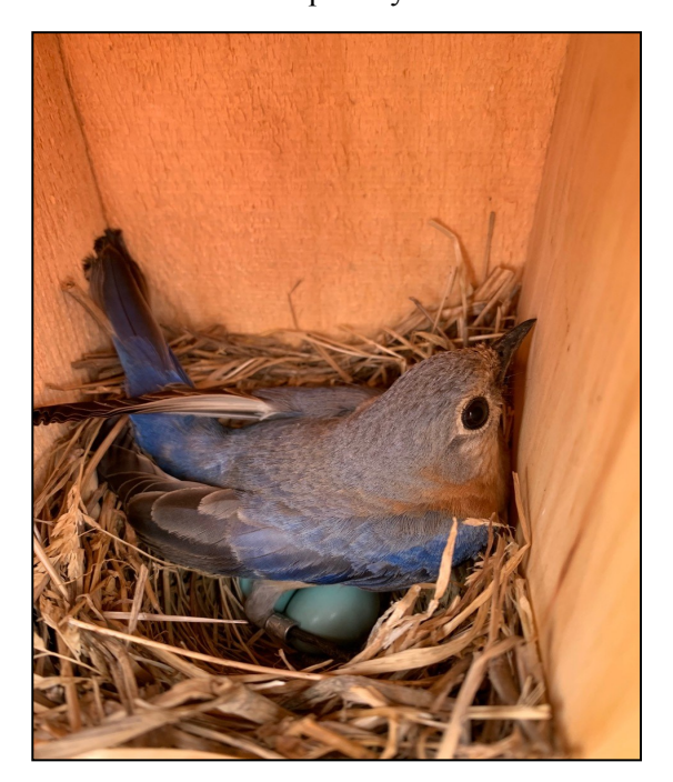
Banded Bluebird mom with eggs

We now have 21 nest boxes at the 4 locations, and as I write this, our first nesting season is winding down, with activity in all boxes. However, only one box has successfully fledged a clutch of 3 Bluebirds. We have had a few boxes occupied by Tree Swallows, and a few that fledged Chickadees, who built the loveliest nests out of moss, lined with a thin layer of horsehair! But to our surprise, the vast majority of boxes have been occupied by House Wrens. We had tried to discourage this (because