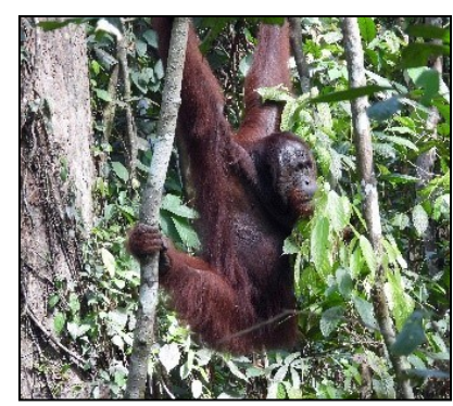
Orangutan, Male, Sepilok Orangutan Rehab Center, Sabah, Borneo, Malaysia

The next day we drove to Taman Nagara National Park, Peninsular Malaysia's major national park, and the first destination on our four-week journey. The next morning we meandered by foot on the boardwalk that coursed the perimeter of the forest, and we noticed a peculiar silence and stillness. Had the haze crashed local insect populations and driven off the songbirds? Or had the boardwalk, noisy from tourists, made these parts of the park less desirable for local wildlife? No way to know, but our subsequent visit to Sarawak state in Borneo would continue like this... lush tropical views spoiled by haze and a curious lack of wildlife, even bird life. But there were plenty of other things to do in Sarawak, like exploring world-class caves and visiting local tribes in their longhouses.